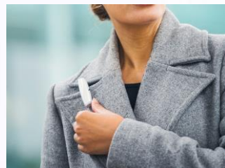
◀ Collar Clip