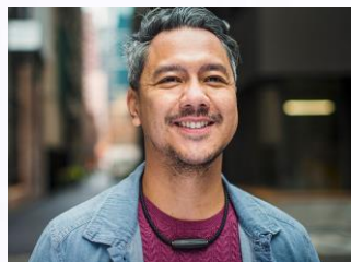
◀ Titanium Necklace